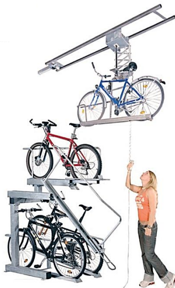
Elektromotorisches Lift- und Schiebesystem