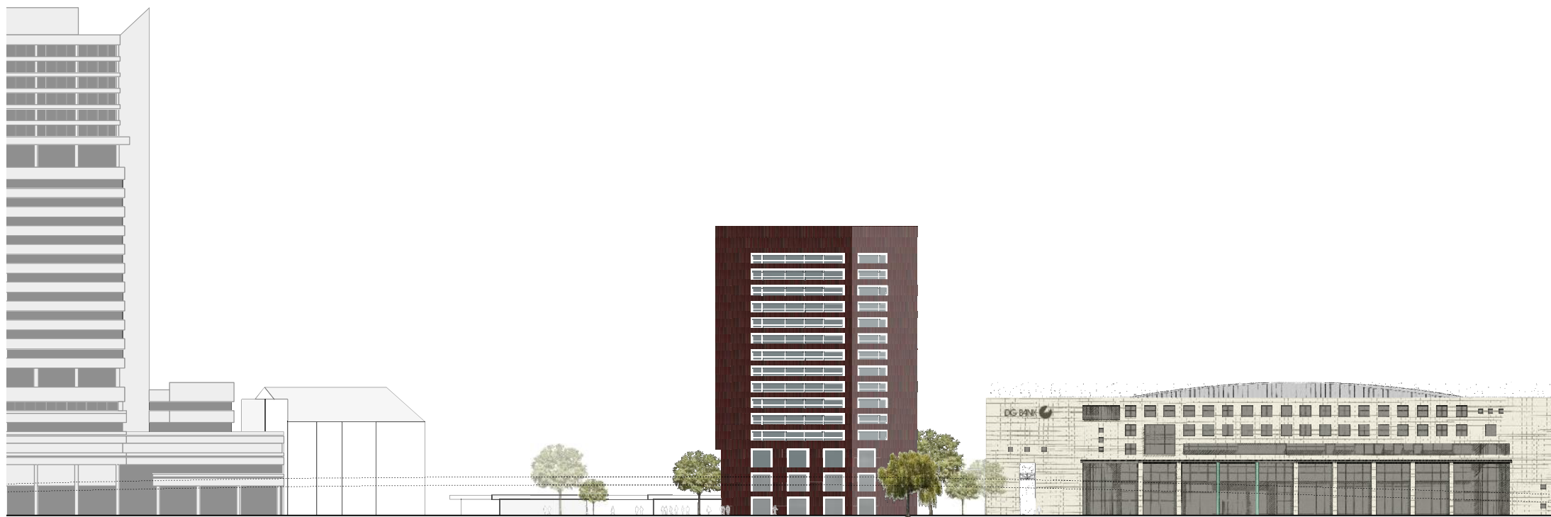
ANSICHT SÜD (BERLINER ALLEE)